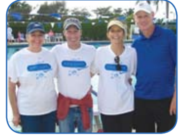
Aqua Champs Staff