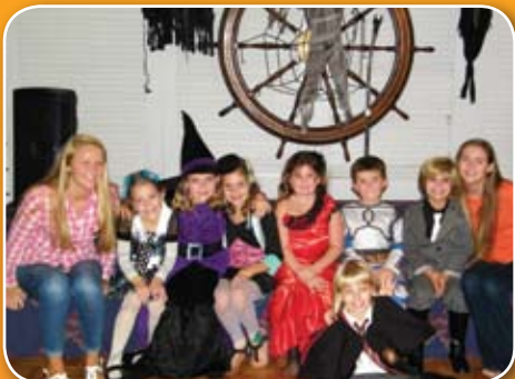
A few of our Club Kids