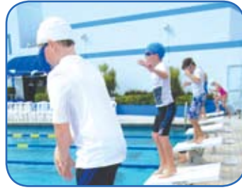
Ready to Race