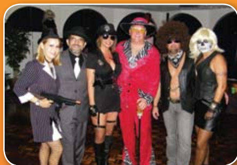
Costume contest winners