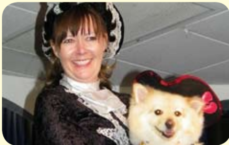
"Palmer" with Fader